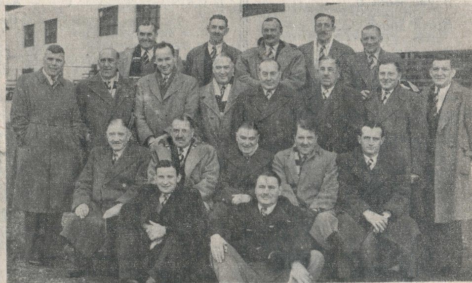
The Barbarians Club Committee, 1952, at Cardiff, January 26th.

35, WINDSOR PLACE, CARDIFF - Telephone 32426