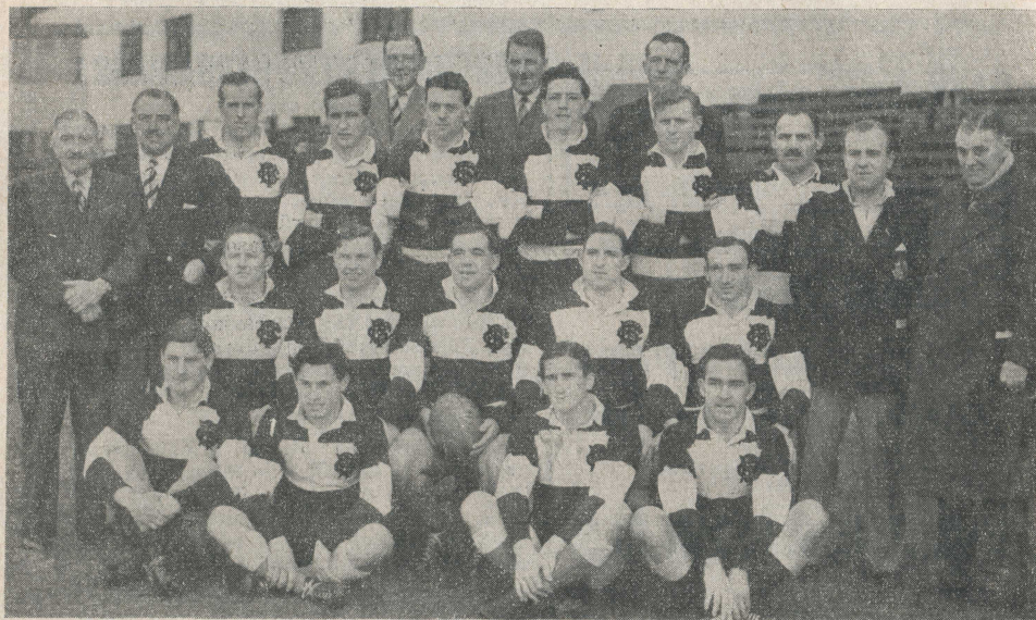
Barbarians XV which played the Springboks at Cardiff Arms Park, Jan. 26th, 1952