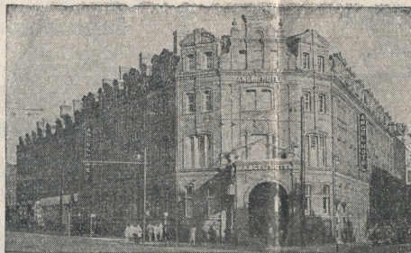
Telephone—Cardiff 26626 (5 lines)

Regd. Office— ALBERT ROAD, PENARTH TEL 297