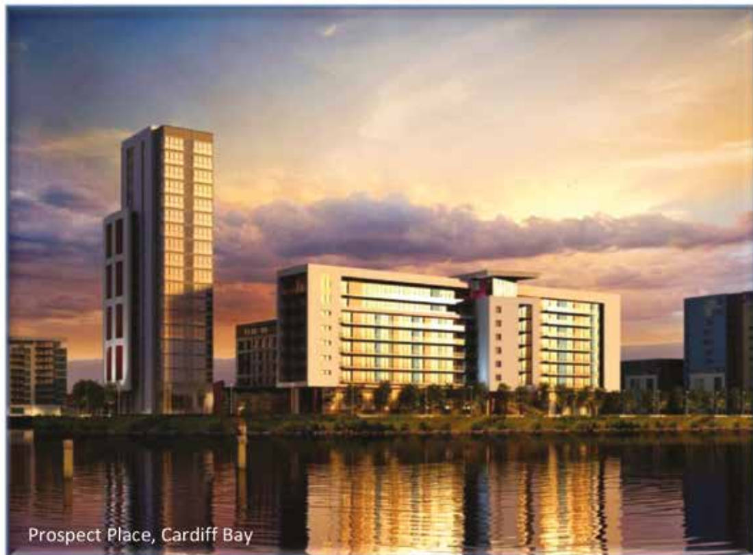
Prospect Place, Cardiff Bay

ISTL, Wales' Premier Mechanical & Electrical Design & Build and Installation Apartment Specialists.