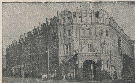
Telephone—Cardiff 26626 (5 lines)

Regd. Office— ALBERT ROAD, PENARTH TEL. 297