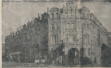
Telephone—Cardiff 26626 (5 lines)

Regd. Office— ALBERT ROAD, PENARTH TEL. 297