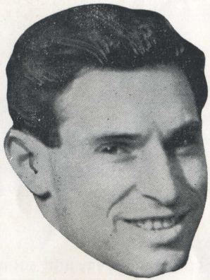
Cliff Morgan W.S.S.R.U. cap 1949. Senior caps 1951-2-3-4-5-6-7.