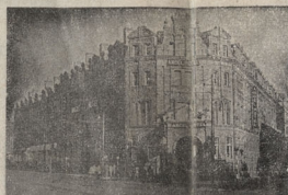
Telephone — Cardiff 3233 (5 lines)

KELVINATOR HOUSE, 24, CHARLES STREET, CARDIFF