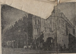
Telephone — Cardiff 32633 (5 lines)

KELVINATOR HOUSE, 24, CHARLES STREET, CARDIFF