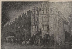
Telephone — Cardiff 3263 (5 lines)

KELVINATOR HOUSE, 24, CHARLES STREET, CARDIFF