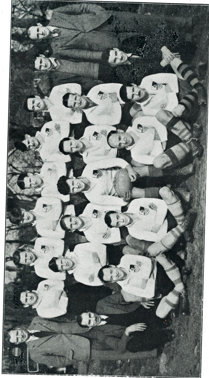
PENZANCE & NEWLYN R.F.C. (THE PIRATES)