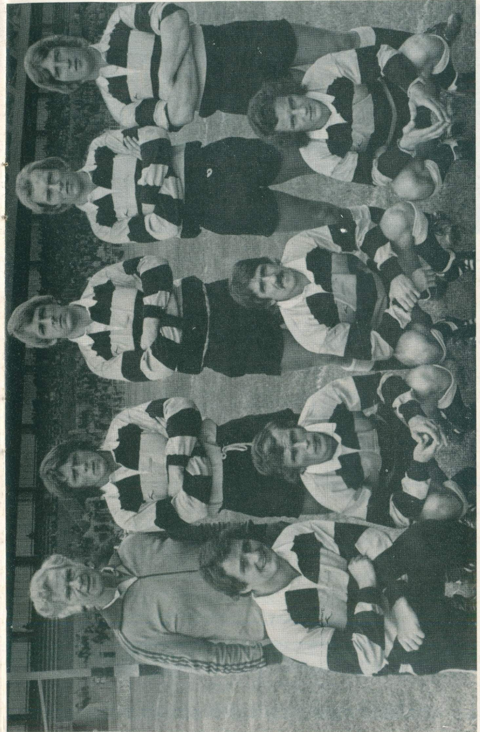
THE 1976 "SNELLING" WINNERS — CARDIFF R.F.C.

Telephon: Brecon 2426 : : Ebbw Vale 302099