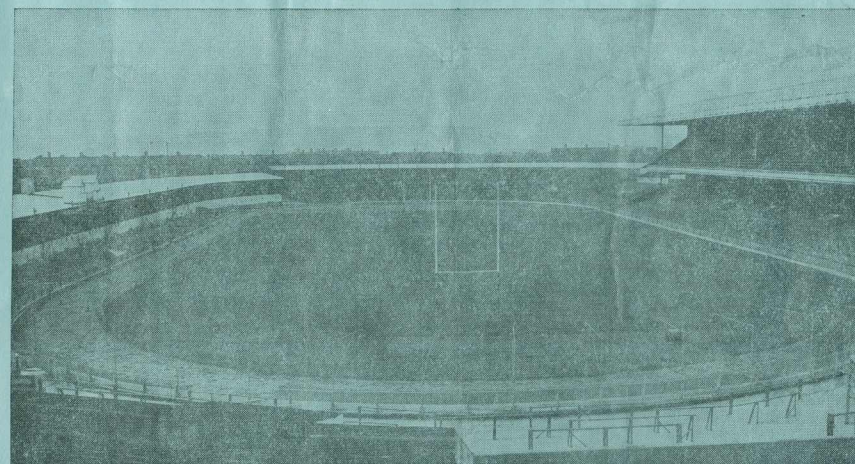
Aerial View of Cardiff Arms Park