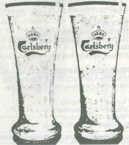
Carlsberg Support the "Saints"