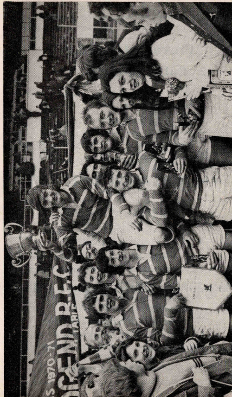
The 1975 "Snelling" winners, Bridgend, in jubilant mood with their trophy

Telephone: Brecon 2426 :: Ebbw Vale 302099