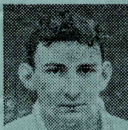
HAYDN TANNER Wales' Captain

Branches: Barry Dock, Bargoed, Pontypridd, Pontypool, Port Talbot, Tredegar