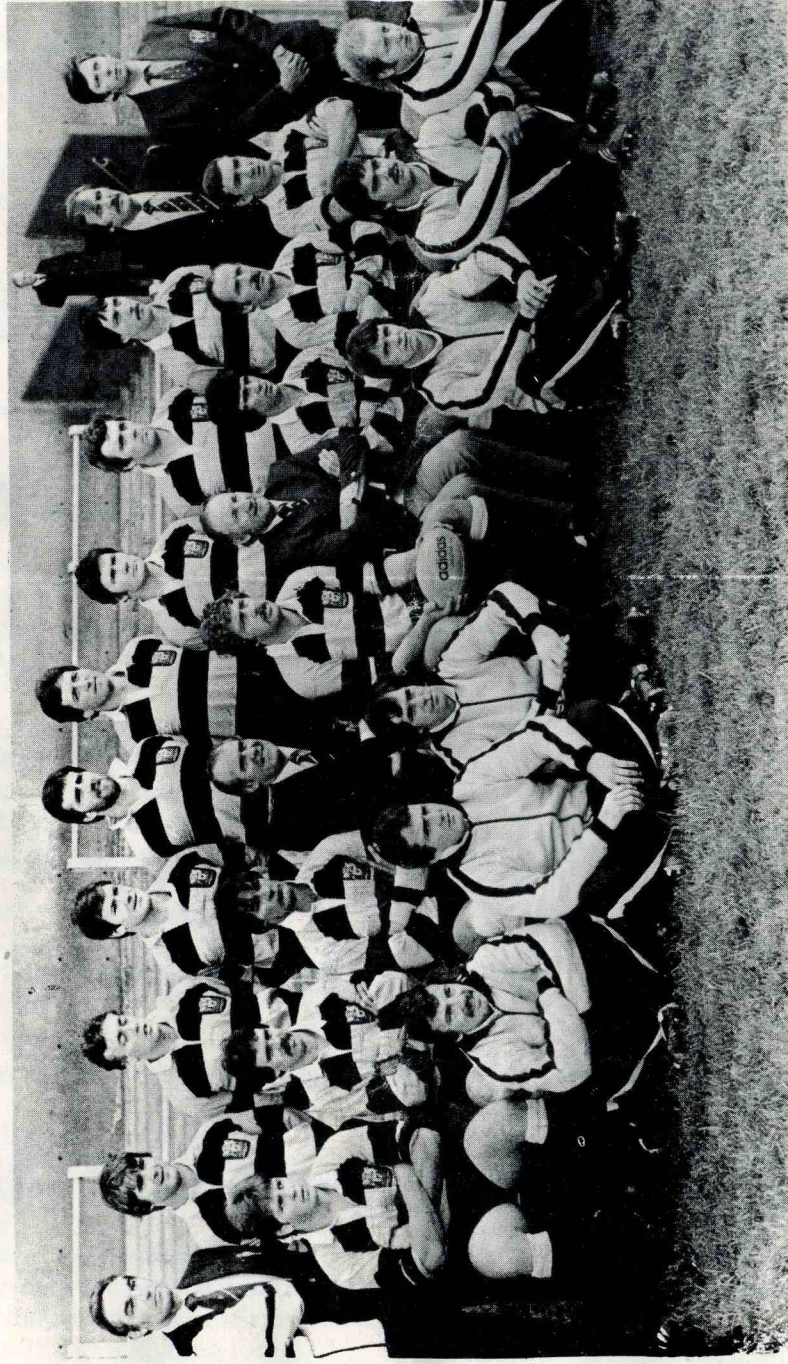
CARDIFF 9 NEW ZEALAND 16 (18th October 1980)