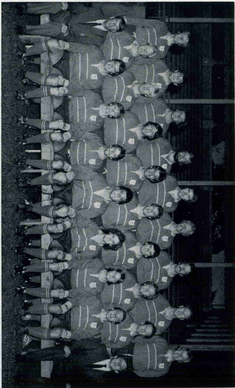
THE SYDNEY RUGBY UNION TEAM