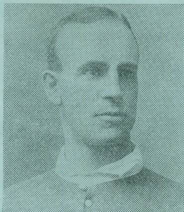
The Late GWYN NICHOLLS

Branches: Barry Dock, Bargoed, Ebbw Vale, Pontypridd, Pontypool, Port Talbot, Tredegar